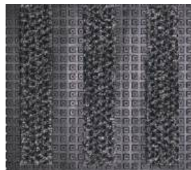
Premier Surface Alba Grey