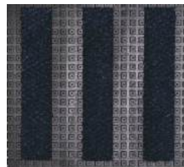
Premier Surface Alba Blue