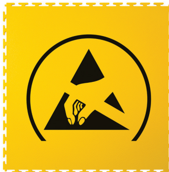
Tough-Lock ESD Logo Tile