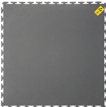
Tough-Lock ESD Grey